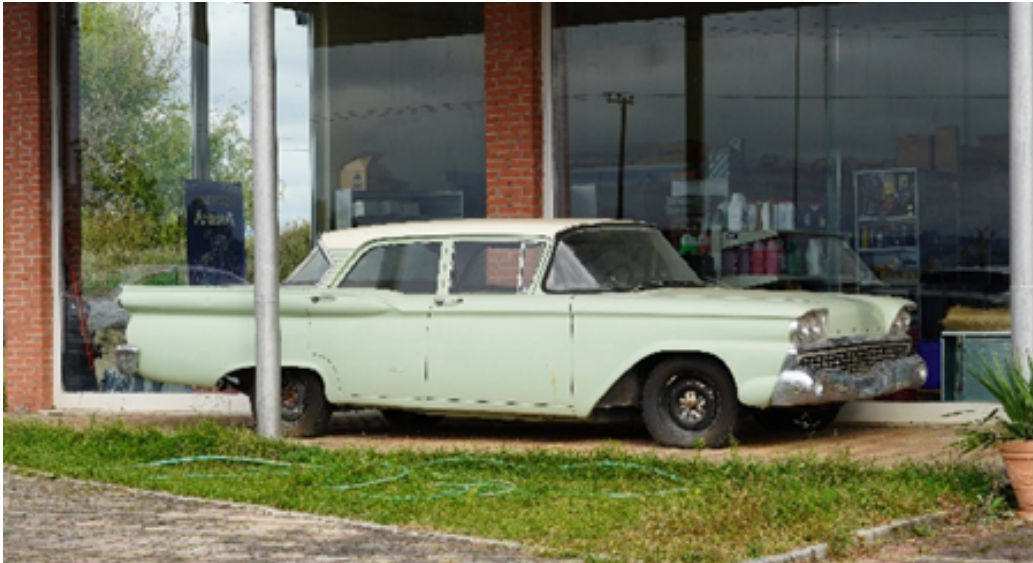
1959 Ford Fairlane, Kozani, Greece

MONTHLY NEWSLETTER ONTELAUNEE AACA OFFICIAL CHAPTER OF THE AACA