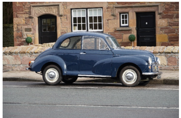
1971 Morris Minor, Scotland

This April, on a tour of Scotland, I became acquainted with a car I didn't know before: the Morris Minor.