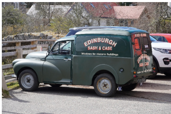
1950s Panel Van, Scotland

Cars and people interested in them are everywhere. On an earlier European river cruise, we had dinner one evening with two U.S. couples who owned antique automobiles one a 1960s Corvette, the other several 1970s-era cars. We enjoyed our visit with them.