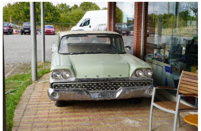
1959 Ford Fairlane, Kozani, Greece

under the canopy toward the left side of the all-purpose building, was a 1959 Ford Fairlane sedan, green with a white roof. There were locals around who only spoke Greek, so there was no way to learn how the Ford got there or whether it was still in use.