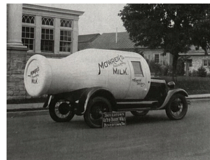
Milk Bottle Vehicle