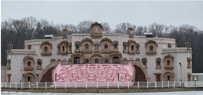
The Hindu Temple in Schuylkill Haven