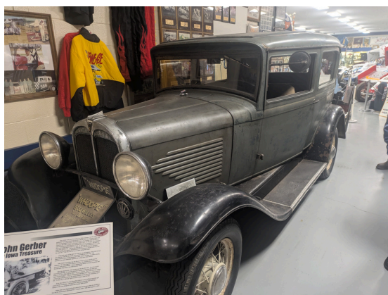
1932 Willys tow car