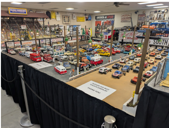
Diarama Reading Fairgrounds Race Track