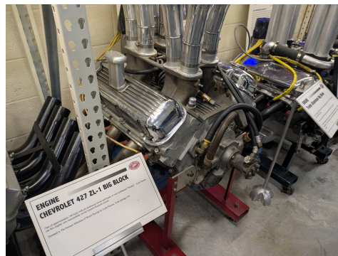
Chevy ZL-1 Aluminum Big Block