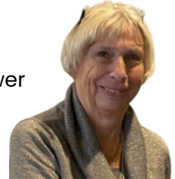
Contact: Phyllis Peters