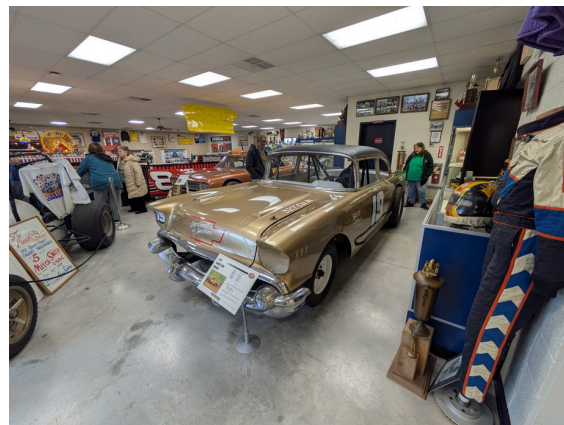
1957 Chevy late model racecar