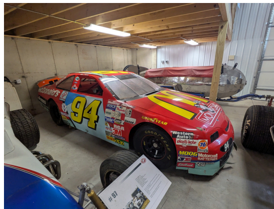
Bill Elliott's NASCAR Winston Cup Car