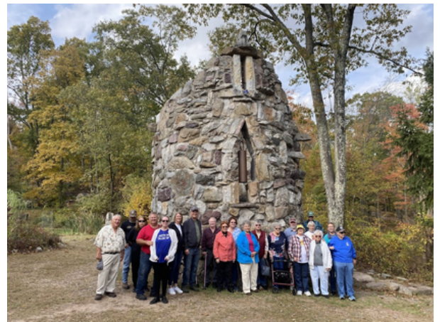
Columcille Megalith Park: Ontelaunee Region AACA Members