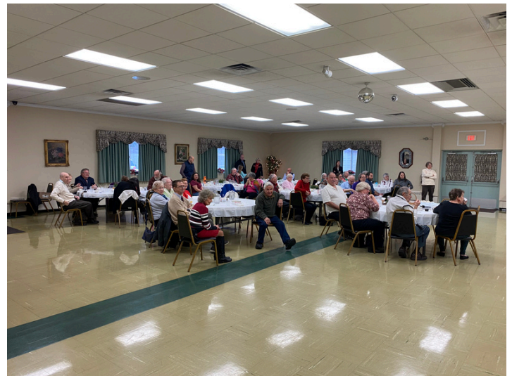
Ontelaunee AACA Members gathered for the Annual Christmas Party at NOVA

Thank you to everyone who attended and helped make this Christmas luncheon such a success. We appreciate the continued support of our members and their families and look forward to another year of enjoyable events, tours, and shared memories. Wishing all our members a Merry Christmas and a Happy New Year.