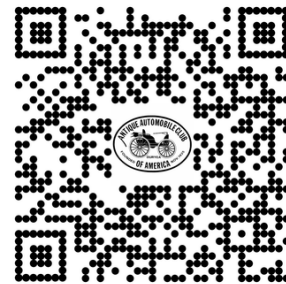
Click on the QR Code to apply for the Education Grant